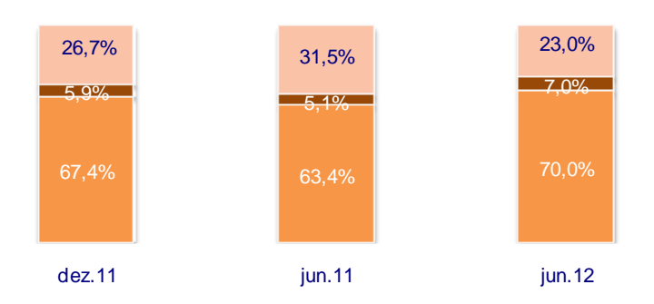
Liabilities and Capital Structure

Equity and provisions increased to 1.457 billion euros at the end of 2012, as opposed to 1.109 billion euros in June 2011. Associação Mutualista raised its share capital by 100 million euros in order to maintain the solidity levels of Caixa Económica at the end of 2011.